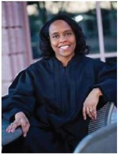
Honorable Cassandra Kirk