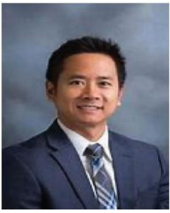
Judge Ethan Pham