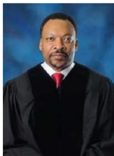
Honorable Clarence Cuthbert