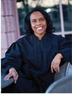
Judge Cassandra Kirk