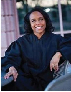
Judge Cassandra Kirk